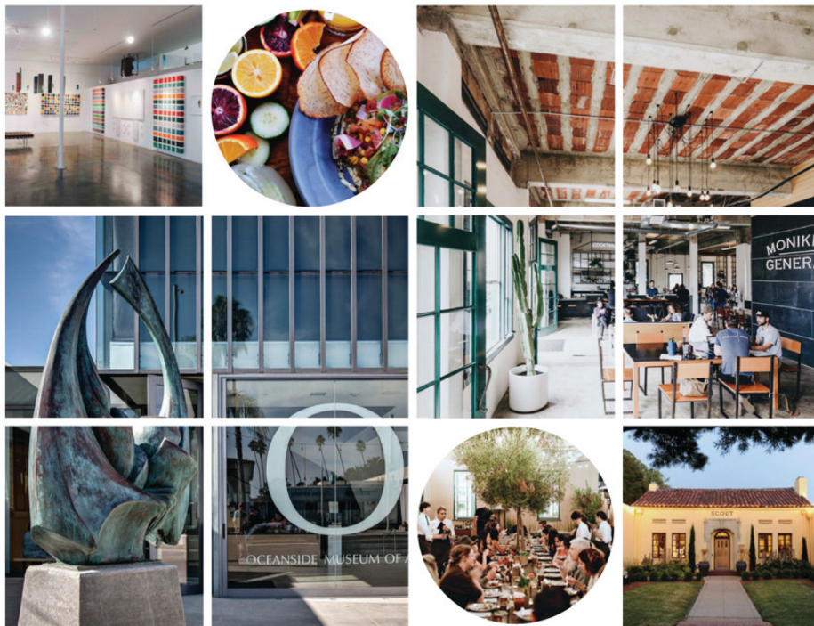
Clockwise from left: Art on display at The Hill Street Country Club; tuna crudo ceviche at Local Tap House & Kitchen; the rustic indoor scene at Moniker General; SCOUT @ Quarters D; Guests indulging in the patio at Moniker General; Opus by James Hubbell on the terrace in front of Oceanside Museum of Art.